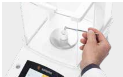
Logging the sample into the software and weighing

Operation of the C(H)S 580 A is simple, fast and convenient. The samples are weighed and registered in the software as manual analysis or analysis via autosampler. Typical sample weights are between 50 and 500 mg. After starting the analysis, the sample is introduced into the furnace and the combustion gases \text{CO}_2 , \text{H}_2\text{O} and \text{SO}_2 are measured in up to four infrared measuring cells. The measurement results can be exported via LIMS, report or text file.