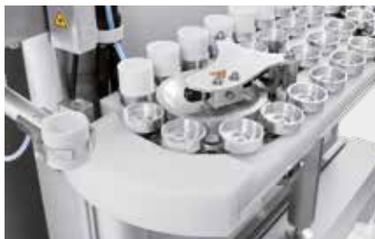
Placement on the autoloader and analysis