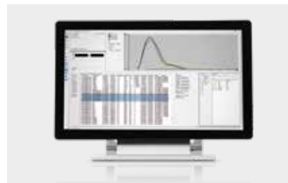
Measurement results and export